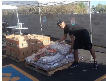
Student distributing produce at Healthy Harvest.