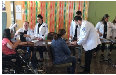
Pharmacy students at a City of Phoenix senior center.

GVAHEC offers a community-based internship for undergrad psychology students in an interdisciplinary setting. Work in teams with students from nutrition, public health and other allied health professions. Students must be enrolled in a course that requires a field experience.